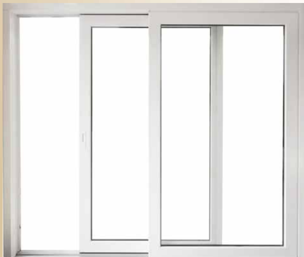
Sliding UPVC Window