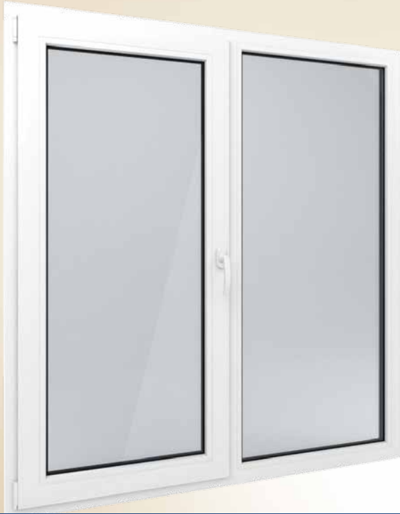
Openable UPVC Window

MALAYAPPA BUILDING PRODUCTS No. 15/3, First Floor, 3rd Street, Jai Nagar, Arumbakkam, Chennai - 600 106.